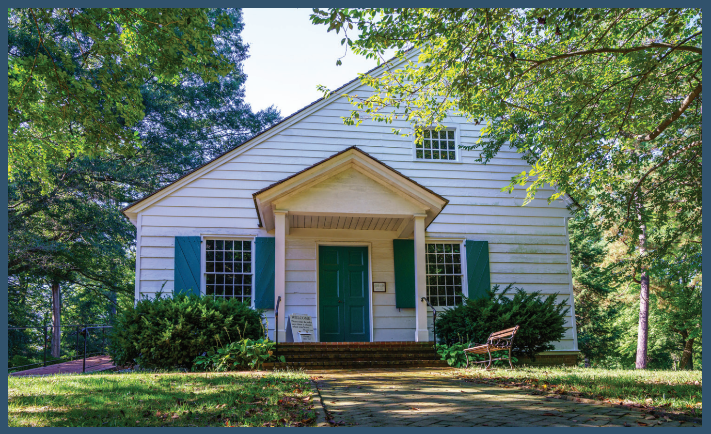
Third Haven Meeting House—Open for viewing

Tour Time: 1½ hours • Cycling Time: 20 minutes Safety Rating (4 of 5): Use Sidewalks on S. Washington St.